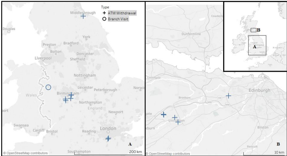
Figure 3. The comparison of locations visited by clients predicted by the described model as anomalous (left) and normal behaviour (right). The scales of maps A and B are different.

Since there were no labeled data available to calculate the precision and recall of the results, it is planned to interview a group of subject matter experts. At the time of writing this article this approach has not been completed. However, it will be done as soon as such an option will